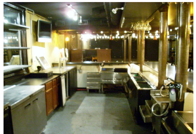
Bar is equipped with 2 4 tap beer units & 3 bin reach in beer cooler, 2 door SS work