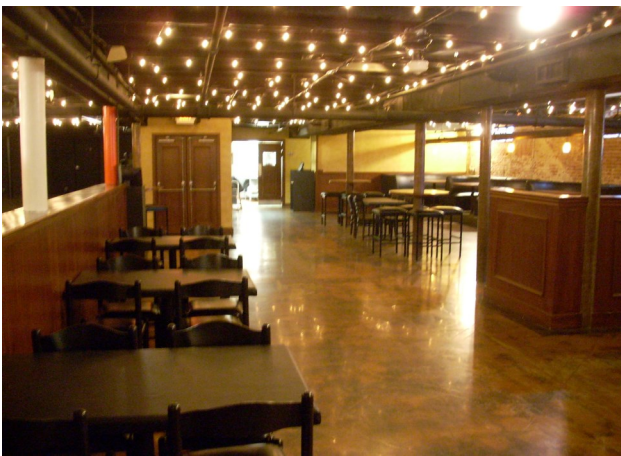
Four top tables with chairs