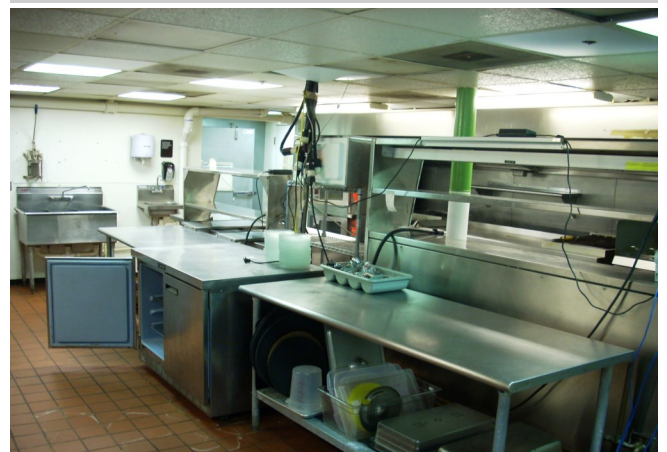
Stainless Steel tables

More info and video at www.BrentHoffman.com Berkshire Hathaway Georgia Properties 770-533-6721(Direct) 770-536-3007 (Office)