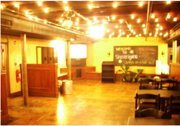
Spacious and room for expansion