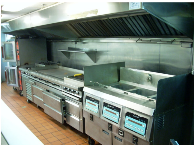
Vulcan Convection Ovens